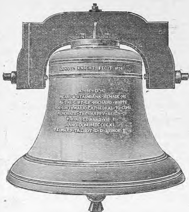
THE TENOR BELL, SOUTHWARK CATHEDRAL, Weight, 50 cwt, 0 qr. 21 lbs.

Bellfounders & Bellhangers, 32 & 34, Whitechapel Road, LONDON, E.