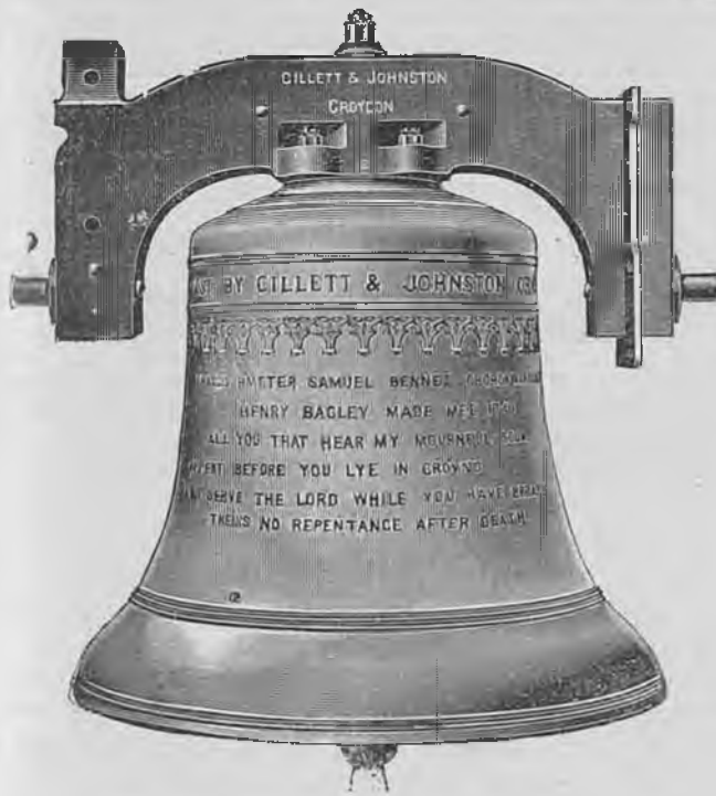
St. Peter's Collegiate Church, Wolverhampton. Tenor (33 cwt.) of the New Ring of 12.