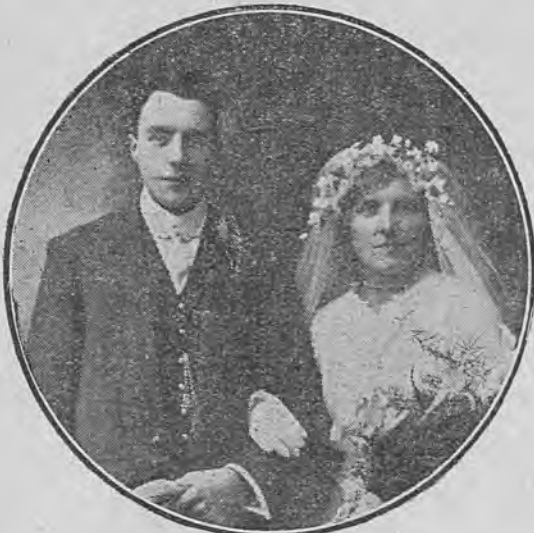
THE BRIDE AND BRIDEGROOM.