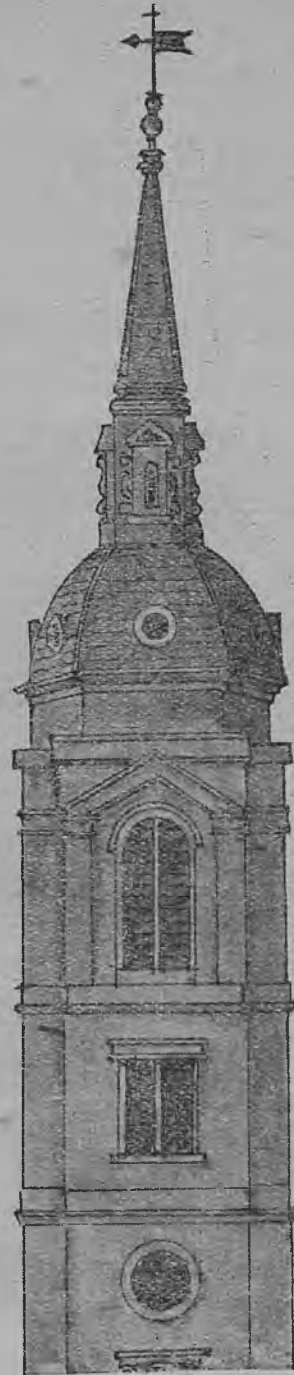
ST. BENET'S, GRACECHURCH.

St. Benet's, pulled down at the same time, was a beautiful little church, surmounted by one of the handsomest towers in London. It possessed, however, only one bell.