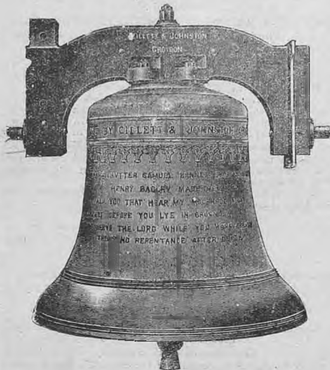
St. Peter's Collegiate Church, Wolverhampton. Tenor (33 owt.) of the New Ring of 12.

WOLFRUN CHAMBERS, WOLVERHAMPTON, MESSRS GILLETT and JOHNSTON, CROYDON, 4th March, 1912 Gentlemen,