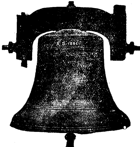
No. 7 Tenor Bell, St. Paul's Church, Bedford.

Also founders of the noted peals of bells at the cathedrals of Worcester, Newcastle-on-Tyne, St. Mary's, Edinburgh, St. Paul's, Dublin, Christ Church, N.Z., and Singapore; the Town Halls of Manchester, Bradford, Rochdale, Halifax, Wakefield, and Kendal, and the Adelaide and Sydney Post Offices in Australia.