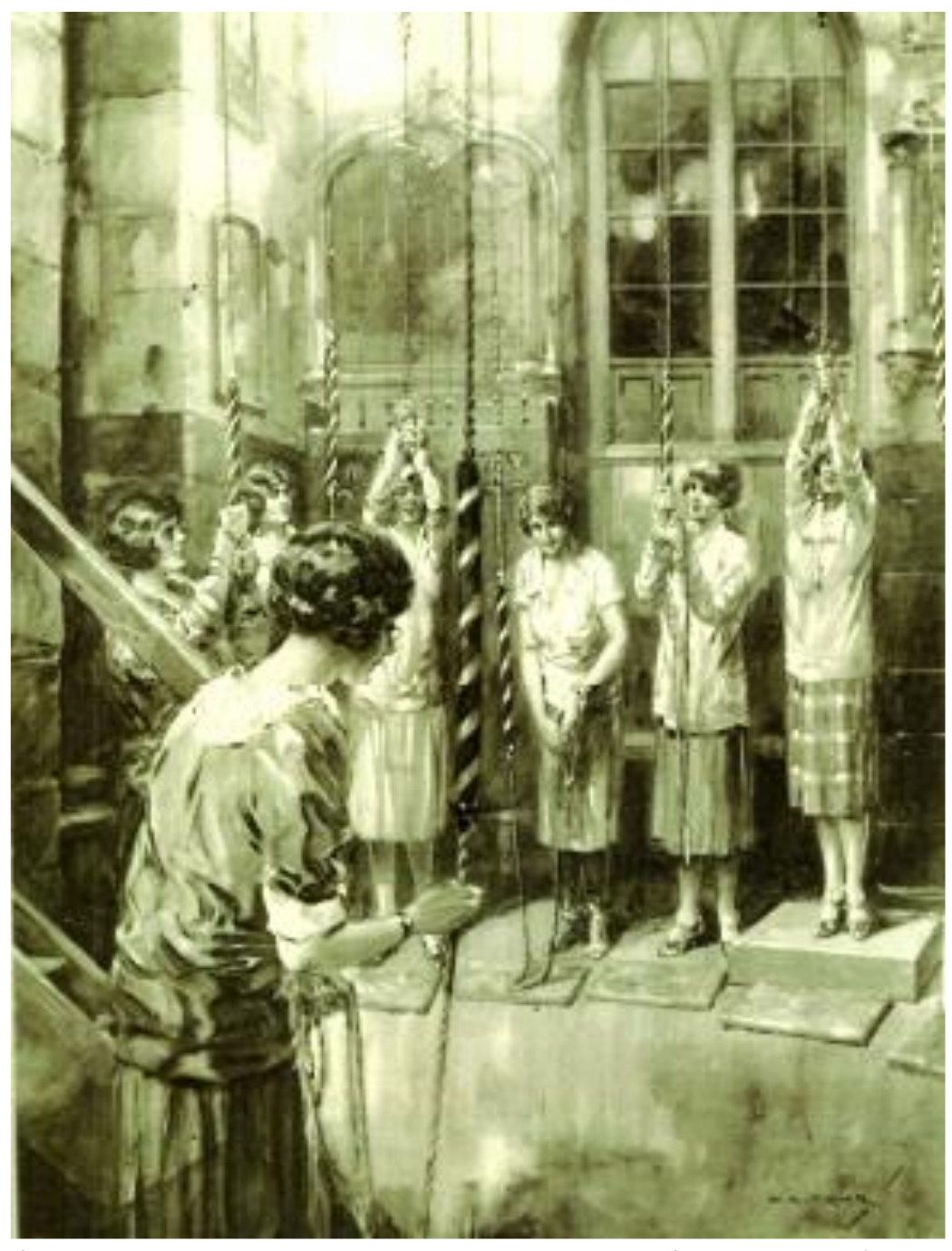
Belles of St Clements! Girl Ringers: Shortly to attempt the Full Peal of Stedman Caters (5,148 Strikes), a feat that involves 3½ Hours Continuous Ringing: Members of the Ladies Guild of Change Ringers at St Clement Danes. Taken from The Illustrated London News , 9 January 1926, page 67 (21.0cm by 27.5cm)