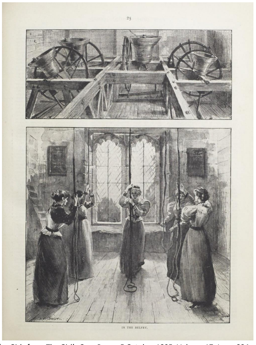
Bell Ringing for Girls from The Girl's Own Paper , 5 October 1895, Volume 17, Issue 824, pages 24 to 27

Although a handful of woman may have rung church bells in the past it was predominantly a male preserve until the end of the 19<sup>th</sup> century. This may in part be because of the difficulty of ringing bells on old fittings, especially plain bearings, but also because of the social standing of women in society in those days. But by the end of the century and following the First World War which saw many local bands depleted of its male ringers, women started to be encouraged to learn and accepted into ringing.