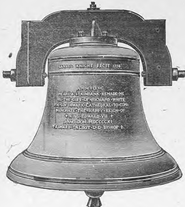
THE TENOR BELL, SOUTHWARK CATHEDRAL, Weight, 50 cwt, 0 qr. 21 lbs.

Bellfounders & Bellhangers, 32 & 34, Whitechapel Road, LONDON, E.