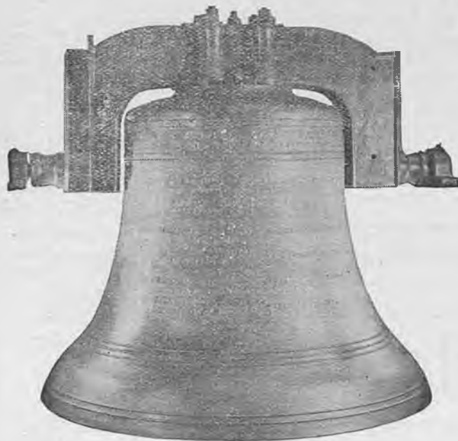
SHERBORNE ABBEY RECAST TENOR. 48 cwt. 0 qr. 5 lb.