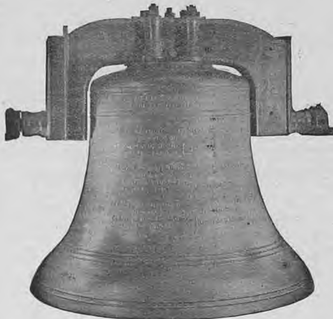
SHERBORNE ABBEY RECAST TENOR. 48 cwt. 0 qr. 5 lb.

ESTIMATES SUBMITTED for Recasting, Retuning and Rehanging