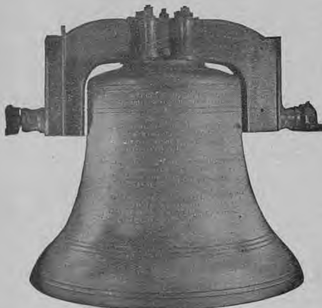
SHERBORNE ABBEY RECAST TENOR.