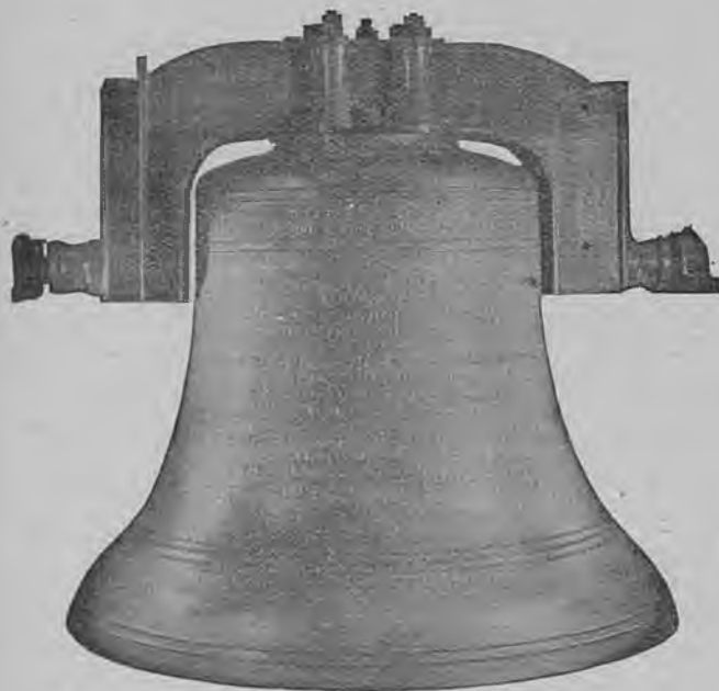
SHERBORNE ABBEY RECAST TENOR. 46 cwt. 0 qr. 5 lb.