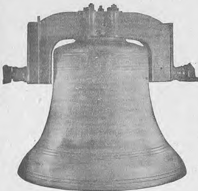
SHERBORNE ABBEY RECAST TENOR. 46 cwt. 8 qr. 5 lb.