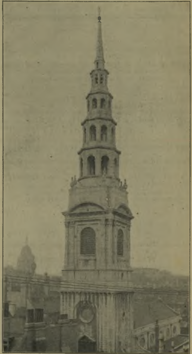
WREN'S STEEPLE AT ST. BRIDE'S.

London will be built up again. Some at least of the churches will be restored, St. Bride's and St. Lawrence certainly, we hope. Once