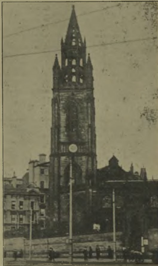
ST. NICHOLAS' TOWER HAS DEFIED THE FIRE.

In the eighteenth century a new spire was added to the old tower, which was raised in height. It was completed in 1750 and stood for 60 years, but on Sunday morning, February 11th, 1810, 'a few minutes' before the commencement of divine service, while the bells were ringing the second peal, the whole structure collapsed, and falling on the church killed 25 people, including 18 children.'