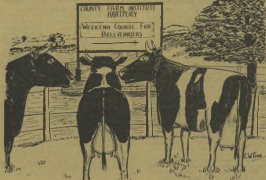
Golly, girls, if any of our dairymen join that lot we are in for a rough time!