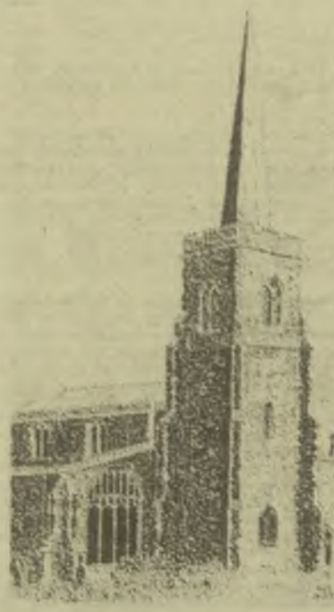
ST. MARGARET'S CHURCH, LOWESTOFT.

Third: The Drifter's Bell. Presented by the Lowestoft Steam Herring Drifter Co. Ltd.